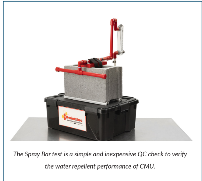
The Spray Bar test is a simple and inexpensive QC check to verify the water repellent performance of CMU.